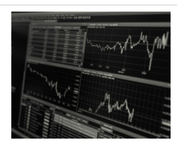
3 Ways We Keep Your Auction Data Safe

Has your auction company been struggling