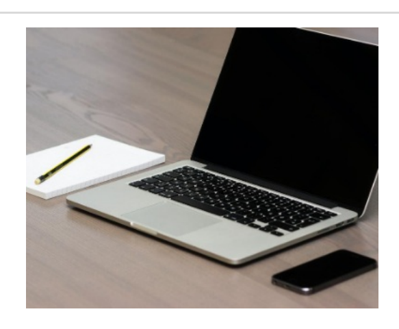
5 Reasons To Have Your Own Auction Website

Has your auction company been struggling