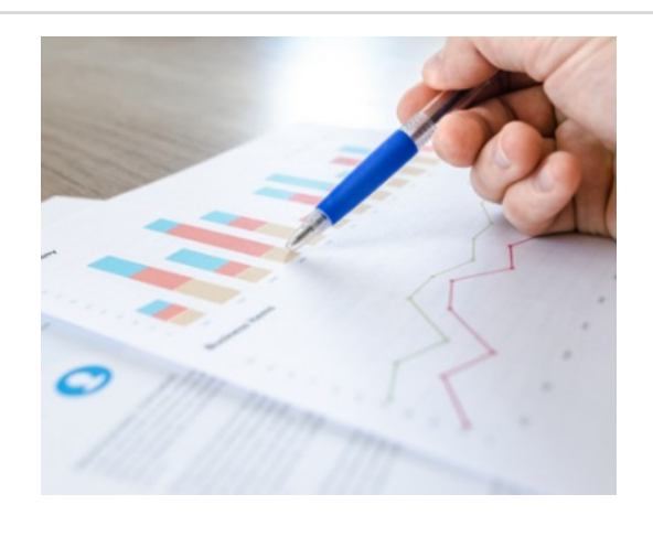
How To Take Advantage Of Your Auction Data