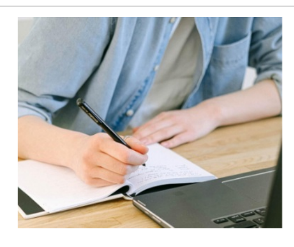
3 Things You Can Do Today For Your Marketing Strategy